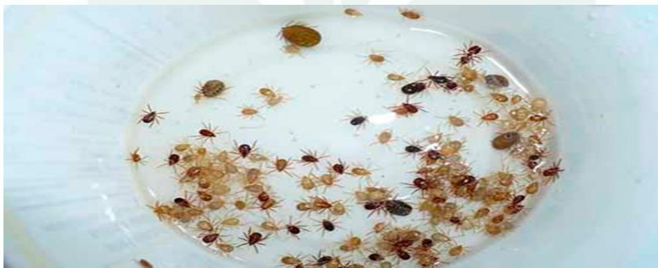
Photo 2. Colonies of D. gallinae mites

in different batteries, at different tiers, and in different production halls were examined (a total of 5 production halls were surveyed).