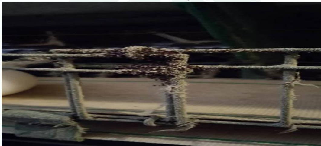
Photo 3. Colonies of red poultry mites at the joints of poultry cage batteries

In terms of efficacy, we observed and studied the effect of a 0.2% aqueous emulsion of Delcid on mites. The solution contains the following components: the active substance deltamethrin, as well as auxiliary substances such as diflubenzuron, piperonyl butoxide, butylated hydroxytoluene, and butylated hydroxyanisole.