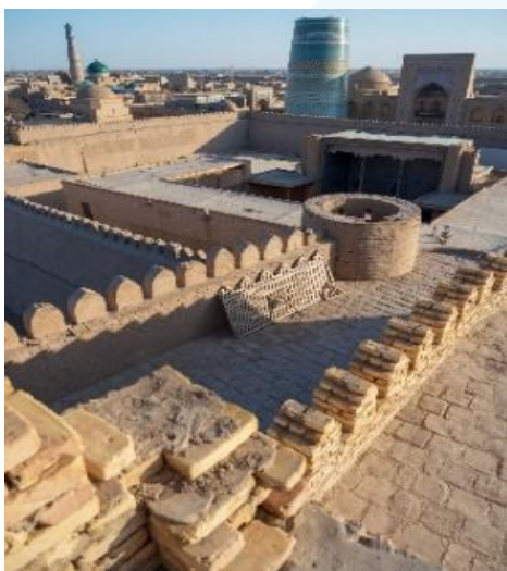
2-rasm. Ichan-qal'ada qo'llanilgan qalin devorlar va ichki hovli tizimi

The Ichan-Kala complex in Khiva is a vivid example of Central Asian folk architecture. The buildings in this area are distinguished by their features such as internal courtyard layouts, narrow streets, and the use of local materials. The thick walls and internal courtyard system used in Ichan-Kala served as an effective solution for adapting to climatic conditions. These solutions can be considered in harmony with the principles of "passive design" in modern architecture. Also, the composition of the buildings in the complex maintains human scale and spatial proportion, which is also relevant in modern architecture.