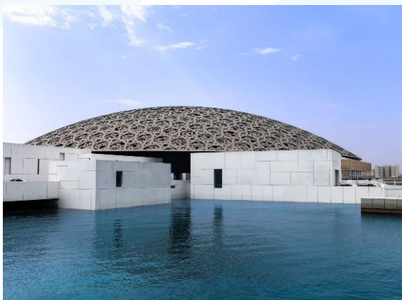
Image 6. Inspired by the famous palm tree shadows under the dome

The Louvre Abu Dhabi Museum is a vivid example of the international application of the principles of folk architecture in modern architecture. In this object, the principle of "play of shadow and light" inherent in traditional Arab architecture is implemented through a modern construction. Light filtered through a metal dome creates a natural microclimate in the interior. This solution is considered a modern interpretation of the principle of casting shadows through palm leaves in traditional architecture. In this regard, this object is an example of innovative processing of folk architectural ideas.