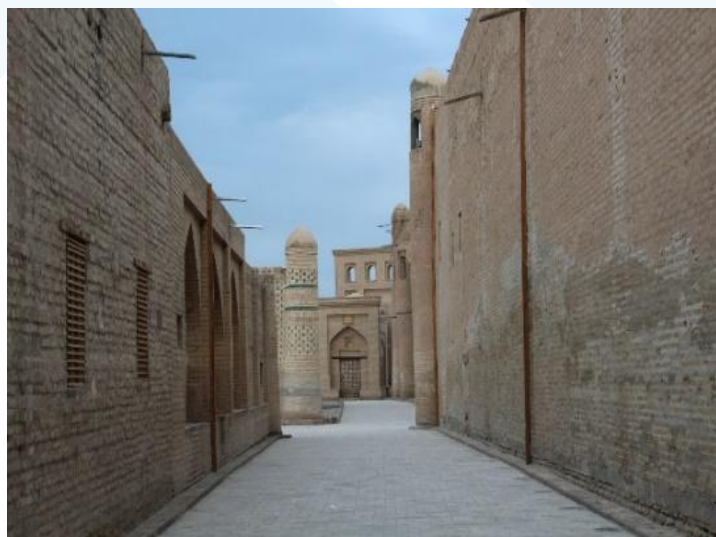
3-rasm. Issiq iqlimda soya va mikroiklim yaratuvchi tor ko'chalar majmuasi