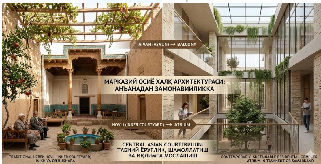
Figure 1. The traditional courtyard concept is transformed into an atrium-shaped space in modern residential buildings.

experiences. The conclusion of mutually beneficial agreements with reputable foreign architectural institutions and their continuous implementation will have a positive impact on the development of national architecture. Folk architecture was formed on the basis of centuries-old experience of mankind, and it developed inextricably linked with natural and climatic conditions, social lifestyle and cultural values. As emphasized in scientific literature, folk architecture is manifested as a form of architecture most adapted to the local environment.