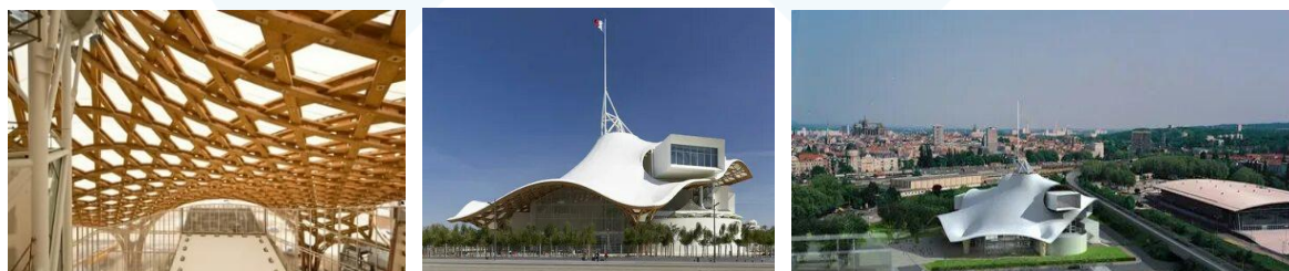
Figure 8. A special waterproof white membrane covering with fiberglass and Teflon coating on a large wooden frame.

Designed by Japanese architect Shigeru Ban and French architect Jean de Gastin, the Centre Pompidou-Metz in Metz is a great example of how elements of folk craftsmanship merge with modern engineering. The wooden structure of the roof is clearly visible in the interior. Architect Shigeru Ban was inspired by traditional Chinese and Asian woven hats and the local art of basket weaving to create this intricate fiber structure.