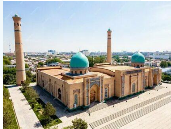
Figure 5. Nationality and its implementation in modern construction technologies

The image shows the main symbol of the complex, the huge porch (entrance) and the blue dome. Here, the art of tiling (complex geometric patterns) inherited from our ancestors has been preserved, but today's durable structural materials and engineering calculations were used in their construction. The second image clearly shows the large area of the complex and its double symmetrical domes.