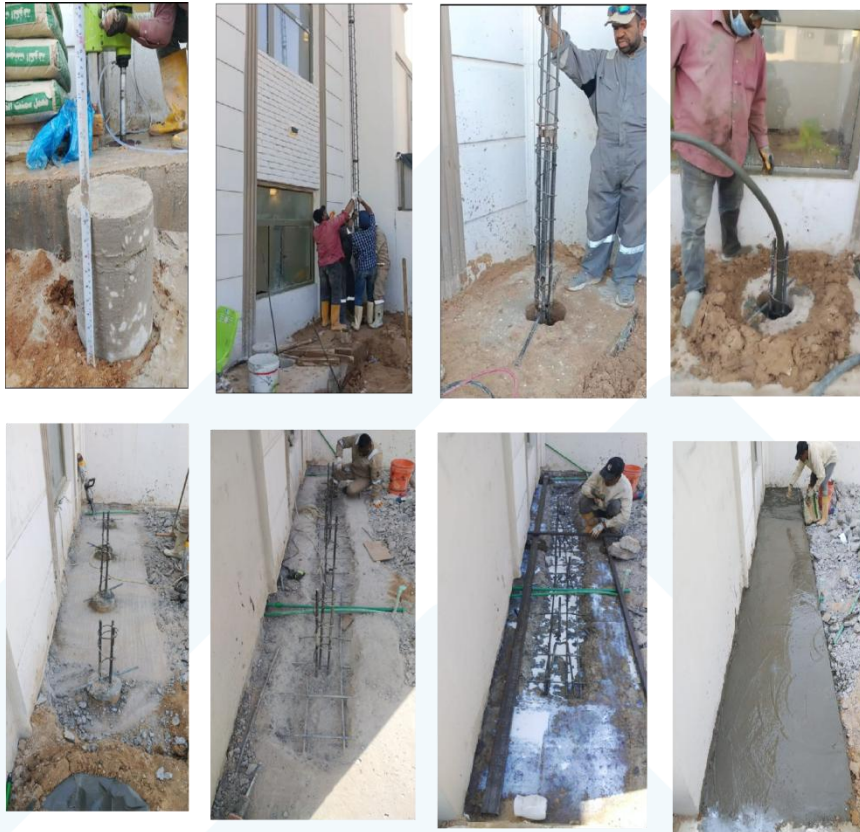
Figure 3: stage of drilling Micropile

https://eurekaopenaccess.com/index.php/8